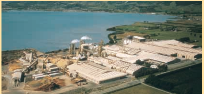
The Nelson Pine plant on the shores of Tasman Bay

Nelson Pine Industries' state of the art log peeling and veneer plant provides veneers as the base material for the manufacture of Laminated Veneer Lumber, which is carried out onsite utilising a continuous layup and press system to produce consistently high quality LVL.